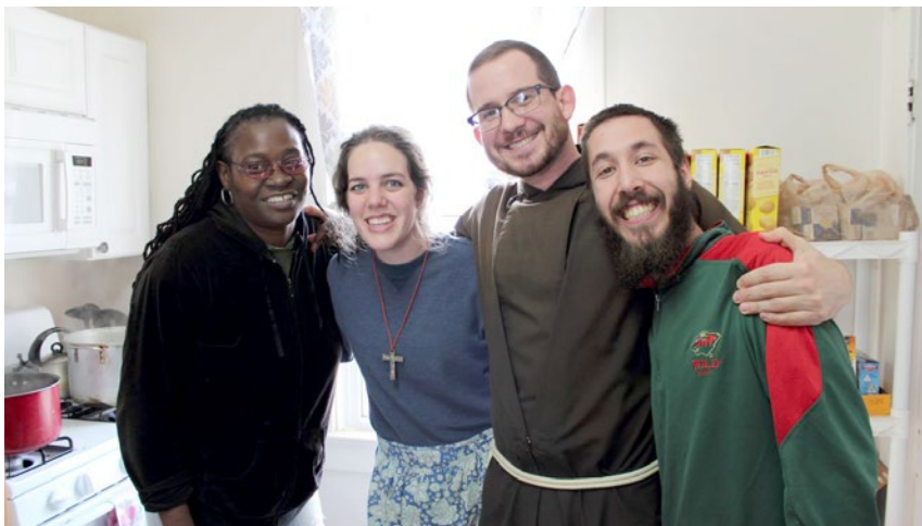
A Simple House gathers together to cook with and eat alongside members of the community.

Read our full Diversity and Racial Justice Statement at catholicvolunteernetwork.org in the "Who We Are" section.