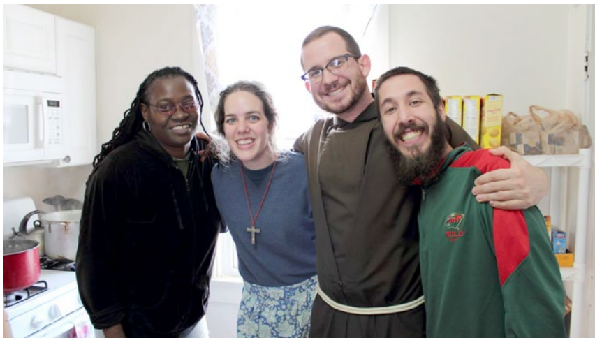
A Simple House gathers together to cook with and eat alongside members of the community.

Read our full Diversity and Racial Justice Statement at catholicvolunteernetwork.org in the "Who We Are" section.